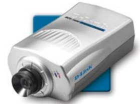
D-Link DCS-1000 Express EtherNetwork Internet Camera

The DCS-1000 uses Motion-JPEG to stream live video at up to 30fps using Motion-JPEG technology. The camera supports resolutions up to 640x480 and five levels of JPEG compression to customize image size and quality to ensure a steady stream to any viewer.