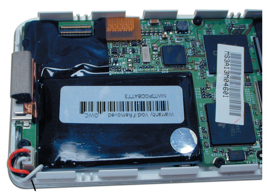
Insert new battery and make sure to route wires as shown - do not pinch them in the case!

Once you have removed the hard drive, look at the logic board and you'll see the large black battery. Gently unplug the 3 wire connector from the board and remove the battery from the unit, setting it aside for proper disposal later. You will probably find that the original battery wires are routed under the logic board and will need to be unwrapped from there to remove.