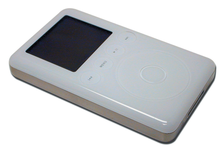
Begin by laying your iPod on it's back on a soft work surface.