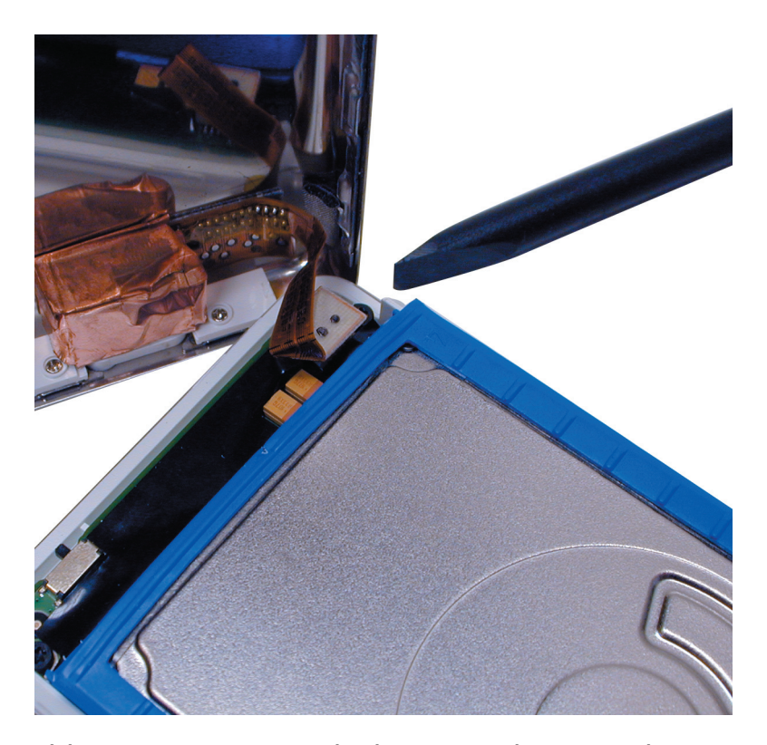
Another view of the ribbon connector, with the screwdriver tool pointing toward it. Do NOT remove the connector - it is not necessary to replace the battery.

Once you have the bottom cover off, GENTLY tip it towards the top as shown. Be exceedingly careful of the ribbon connector that goes to the audio jack. It is easily damaged.