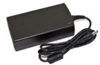
Power supply and cable