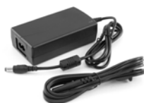
Power Supply and cable