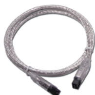
FireWire 800 (1394b) 9-9 pin cable