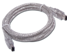
FireWire 400 (1394a) 6-6 pin cable