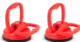
Two suction cups