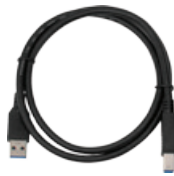
USB 3.0 (A to Standard-B) cable