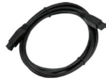
FireWire 800 (1394b) cable