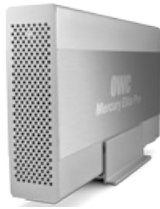
Mercury Elite Pro (with vertical stand)