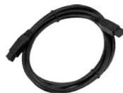
FireWire 800 cable