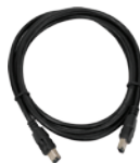
FireWire 400 cable