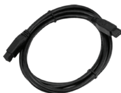
FireWire 800 (1394b) cable