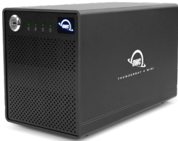
OWC ThunderBay 4 mini with Thunderbolt 2