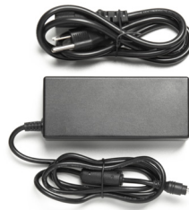
Power supply and cable