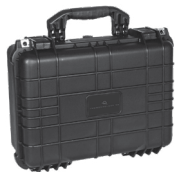
Ballistic hard-shell case