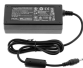
Power supply and cable