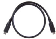
USB 3.1 Gen 1 Type-C cable

* Space Gray model shown, all information herein applicable to all models.