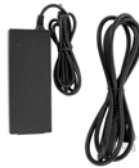
Power supply and cable