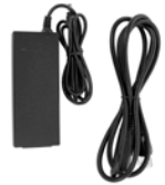
Power supply and cable

* Space Gray model shown, requirements and usage identical for all models.