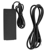
Power supply and cable

* Space Gray model shown, requirements and usage identical for all models.